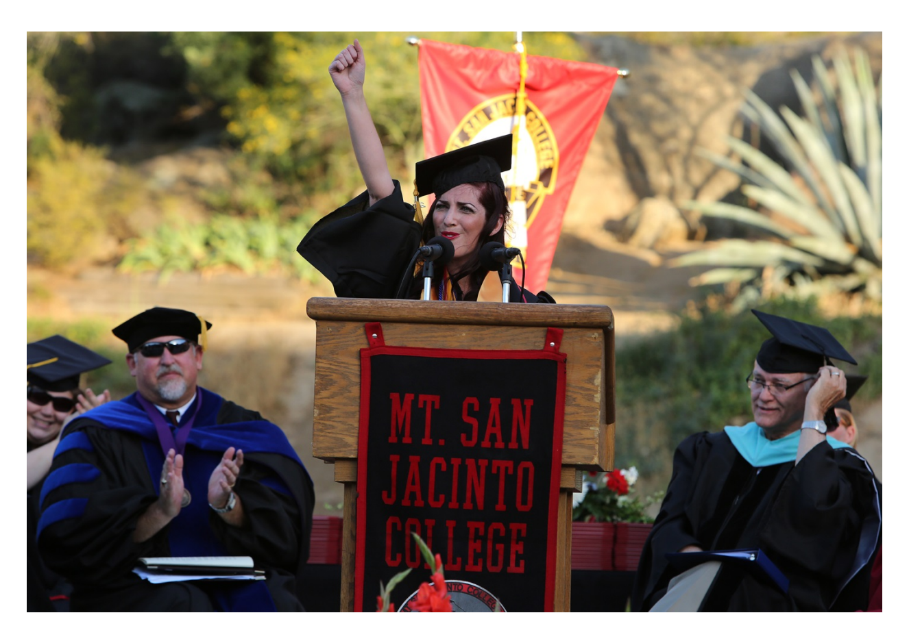
Goal 1 Reduce time to completion of student educational goals to increase degree, transfer, and certificate completions