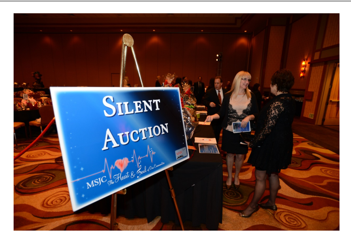
Goal 4 Improve fiscal responsibility that is sustainable for the long-term