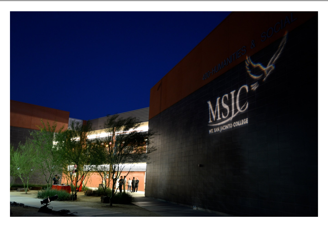
Goal 2 Drive institutional decision-making using internal and external data to inform planning and prioritize resources